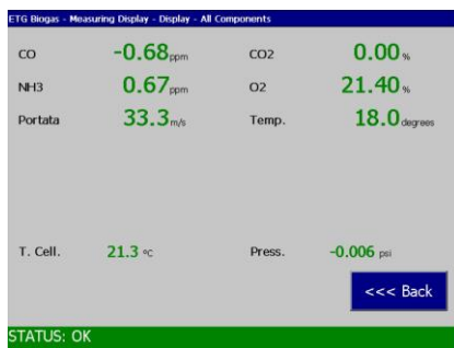
Trend and digital value